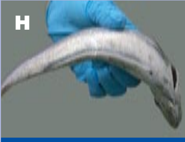
High: fish out of rigor, still quite rigid.

Very High: fish pre-rigor or in rigor, rigid.