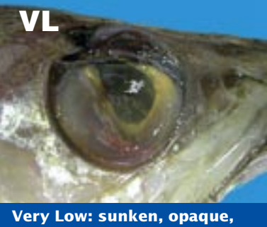
Very Low: sunken, opaque, cloudy, bloodshot, damaged.