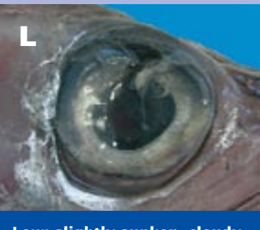
Low: slightly sunken, cloudy.