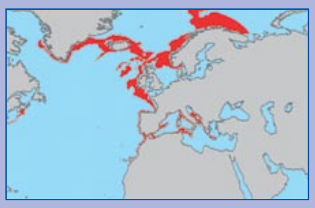
Species distribution map for blue whiting (Micromesistius poutassou).

Blue whiting (Micromesistius poutassou) is a pelagic species closely related to cod, haddock and hake. Although widely distributed in the eastern and western North Atlantic and the Mediterranean, Irish vessels target this species in a small area of its distribution off the Porcupine Bank (VIa, VIIb, VIIc) and the Rockall Bank (VIb), landing catches for fishmeal and more recently, for human consumption.