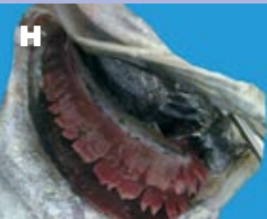
High: good red colour, mucus transparent.