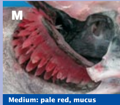
slightly cloudy and viscous.