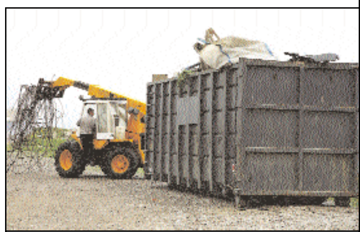
The one day clean-up at Castlemine Harbour was a big success and local producers hope to maintain the level of cleanliness achieved.

netting etc. The clean-up was deemed to be a big success and many local producers expressed a desire that such clean-ups be organised regularly to allow them to maintain the area so that it remains safe, user friendly and open for the enjoyment of the public.