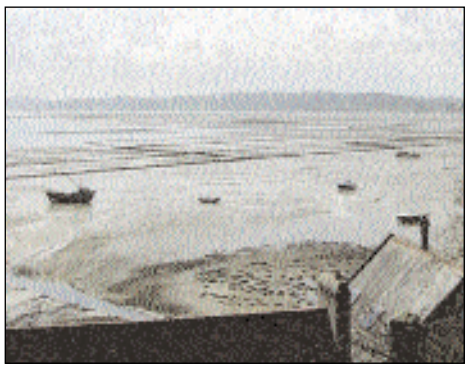
Parcs are scattered throughout the bay and occupy both deepwater and intertidal areas

The group left St.Brittany and travelled due north to Caratec Bay which is located north west of the town of Morlaix. Carantec, unlike Quiberon, is dedicated to the inter tidal/shallow water culture of gigas and to a lesser extent edulis ovsters. They are three main companies operating in the bay and the annual production is in the region of 3.5k to 4k tonnes with the water being Class A. One of these companies, Les Huitres Cadoret owns a licensed area of 500ha and produces 2k tonnes annually. The 500 ha's cover a multitude of different parcs of various sizes, which are scattered throughout the bay and occupy both deepwater and intertidal areas Oyster seed is obtained from all over France and both wild and hatchery is used. In total 18-20 tonnes of G7 seed is acquired annually and is deployed directly on the bottom or held in