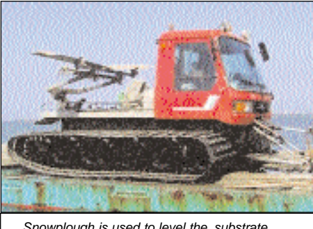
Snowplough is used to level the substrate

ous jobs as all parcs are routinely checked. These include cleaning beds,