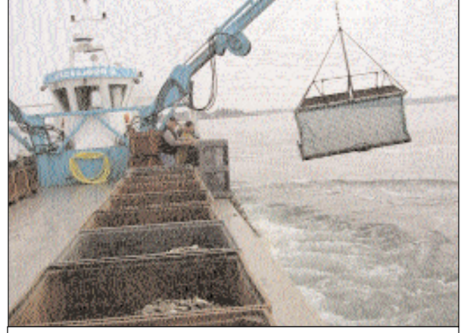
Spreading of half tonne bins of ungraded and sub-market size gigas.

first of these was the spreading of 18 x 1/2tonne bins of un-graded and submarket size gigas. This was carried out by reving the engines to 2k revs approx, putting the rudder into reverse and allowing the boat to spin on its main axis. The bins were then individually tipped over the side and the whole operation took