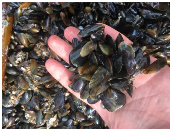
Fig. 1: Seed mussel found on the north side of Howth

Much larger seed mussels were found in the north side. The area represents 8 hectares approximately but moorings and buoys in the area limited the survey. At the time of the survey the average size of the seed was 28.48 mm with the main population represented in the sample comprised between 28 and 32 mm (54% of the measured mussels). The seed is of good quality and very little waste was picked up in the dredge (17% from samples). There were a few small starfish on the location, but their predatory impact was not visible at the time of the survey. The grab was deployed eight times in the area and the average density was found to be 65 tonnes/hectares, up to 97 tonnes/hectares for Grab 5 (see GH5 on the map). The estimated tonnage for the area at the time of the survey was some 520 tonnes. The seabed is mainly coarse sand on mud.