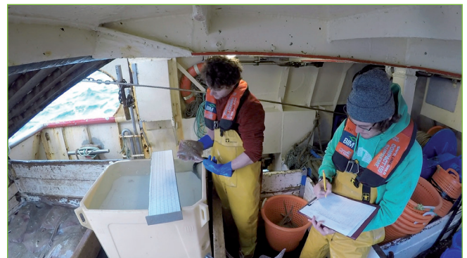
Figure 2. Vitality assessment on board the MFV Eblana

The trial was conducted east of Howth in the Irish Sea, ICES area 7, from the 10th to 12th January 2019 onboard a 22 m trawler, the MFV Eblana (D379) (Figure 1). The vessel targeted ray species using a single otter trawl with 16 " rubber discs on the ground gear, and 90 floats on the headline. Codend mesh size was 120 mm diamond in compliance with the discard plan (EU, 2018). All fishing operations took place as per normal fishing practices.