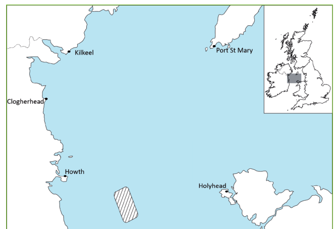
Figure 1. MFV Eblana (D379) and trial location (hatched area) ICES 7a Irish Sea

The trial was conducted east of Howth in the Irish Sea, ICES area 7, from the 10th to 12th January 2019 onboard a 22 m trawler, the MFV Eblana (D379) (Figure 1). The vessel targeted ray species using a single otter trawl with 16 " rubber discs on the ground gear, and 90 floats on the headline. Codend mesh size was 120 mm diamond in compliance with the discard plan (EU, 2018). All fishing operations took place as per normal fishing practices.