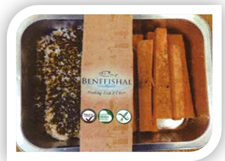
"Benefishal" healthy fish & chips prototype

82% of respondents said they would be willing to buy fish with functional seeds in the breadcrumbs